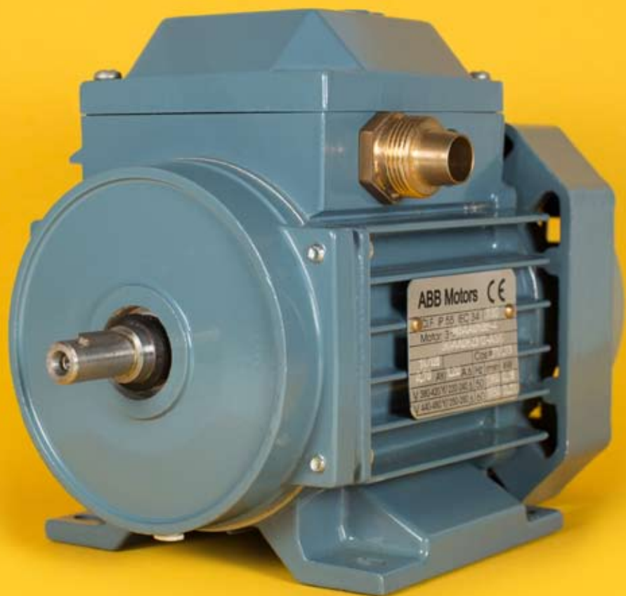
ABB Motors CE D.F. P. 55 EC 34 I Motor 3- COP V. 380-420V 50/60 Hz V. 440-480V 50/60 Hz